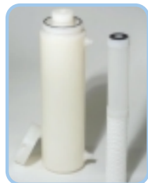
SMOPEX® cartridge and housing