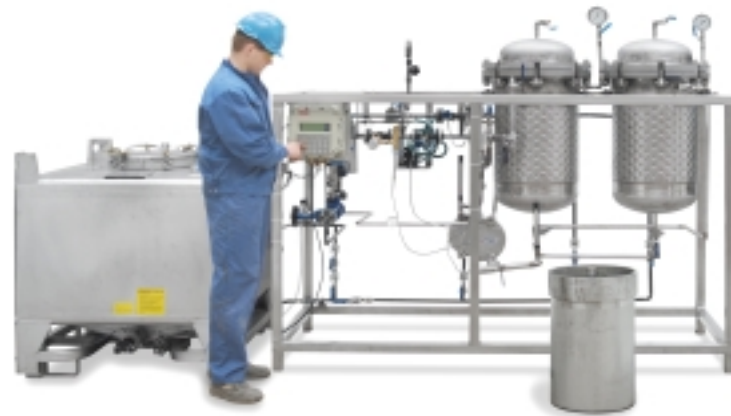
SMOPEX® column skid