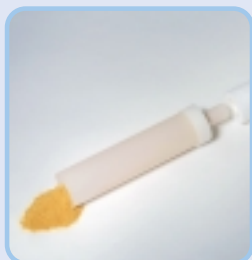
SMOPEX ® cartridge

Johnson Matthey can provide the SMOPEX ® fibres, in the form that is most suitable for the customer. This can either be for use in stirred batch reactors, or the fibres can be pre-packed in a cartridge or column, also supplied by Johnson Matthey, to offer a complete engineered recovery of metals.