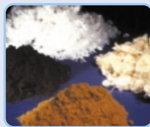
SMOPEX ® fibres